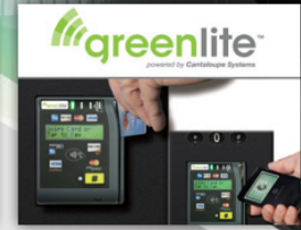
Credit/Debit & mobile reader options.