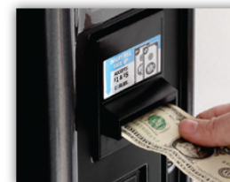
Premium Currency Acceptors

Keep your customers happy by with all their favorite chips, crackers, cookies, candy & confections.