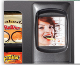
Back lighted point of sale window for advertising and specials.