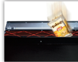
iVend® Guaranteed Delivery System

Keeps customers satisfied and reduces service calls for misloaded product.