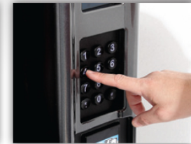
Large and easy to read selection buttons with Braille identification.