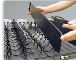
Re-configure trays to almost any package size in the field with no need for tools.