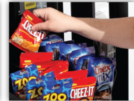
Dispenses All Brand Name Products

Keeps customers satisfied and reduces service calls for misloaded product.