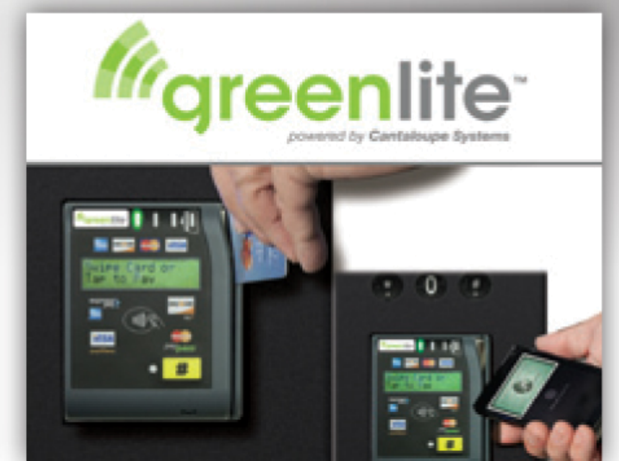
Credit/Debit & mobile reader options.