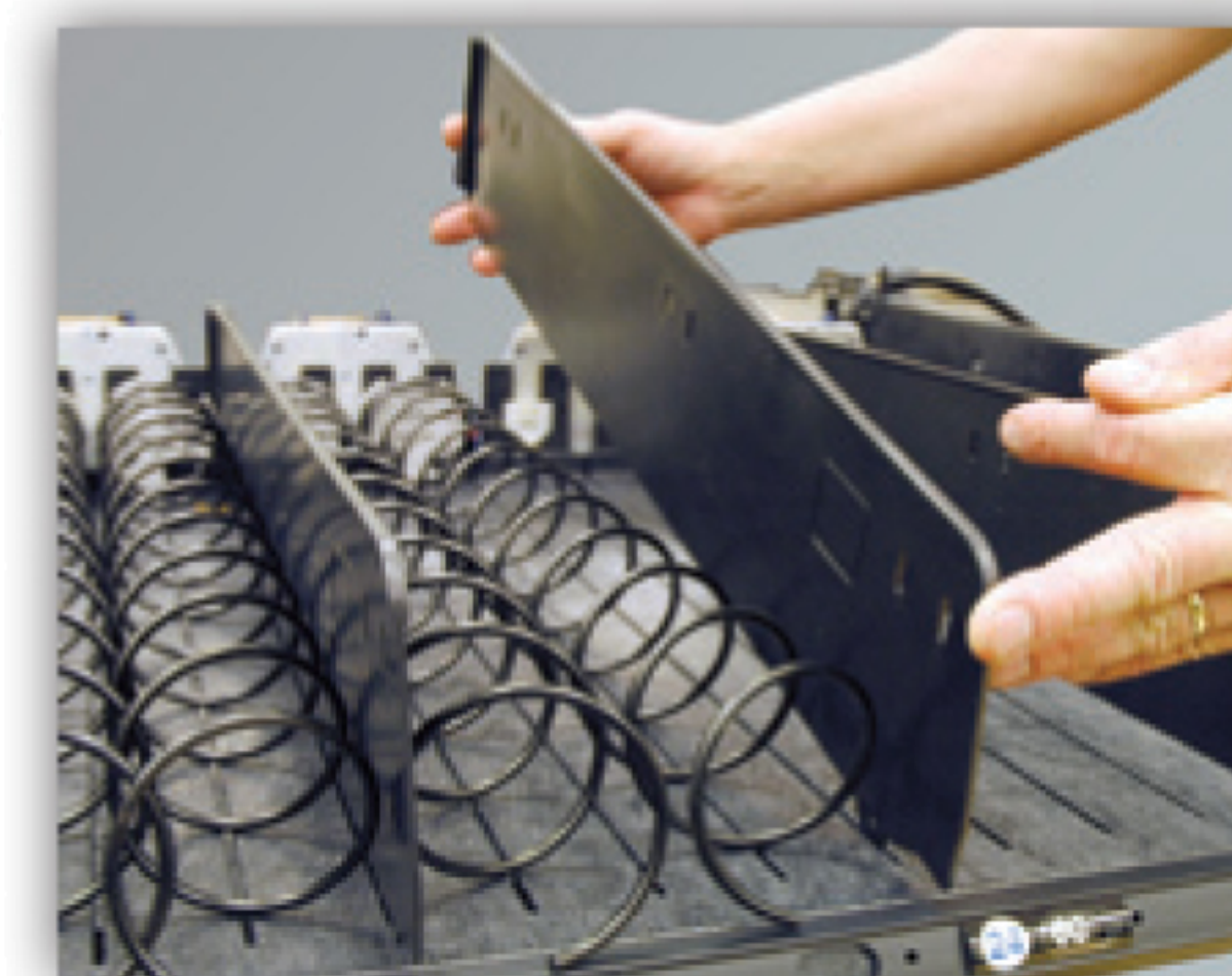
Re-configure trays to almost any package size in the field with no need for tools.