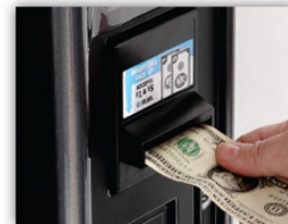
Premium Currency Acceptors

Includes standard electronic coin acceptor and $1 & $5 bill acceptor.