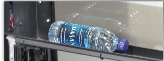
Elevator Gently Delivers a Wide Range of Beverage & Dairy Products